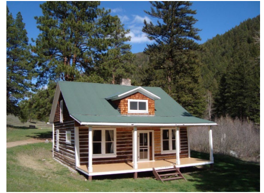
Restored Hogback Homestead, 2023. For Rent $75 per night