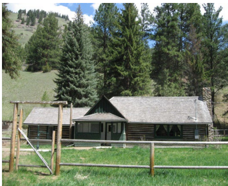
Restored Morgan Case Homestead, 2023 For Rent $75 per night

First, rehabilitating the Hogback Homestead as a cabin rental required conducting data recovery for a pre-contact archeological site for areas of impact such as the access road, vault toilet and drain field. The artifacts demonstrated a continual occupation of the area continually for the past 10.000 years! The Hogback Homestead and the sub-surface archeological site are both eligible for listing on the National Register of Historic Places.