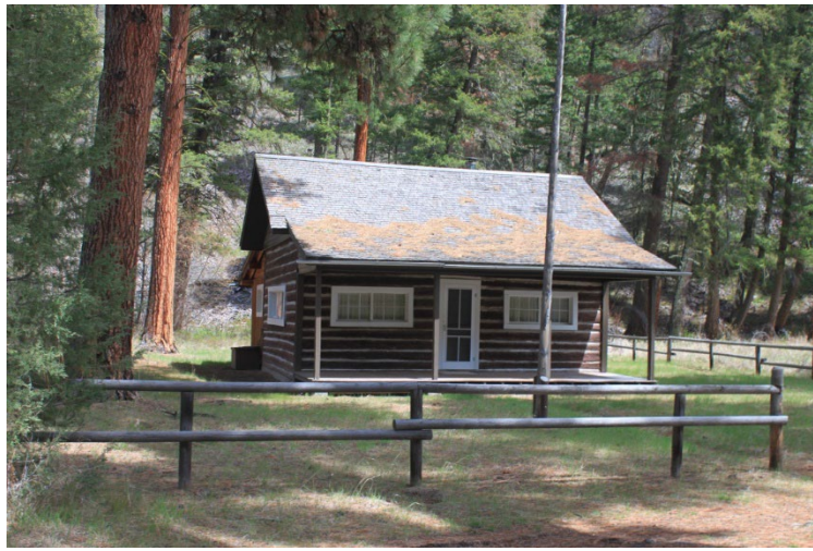
Rock Creek Guard station, granite County MT